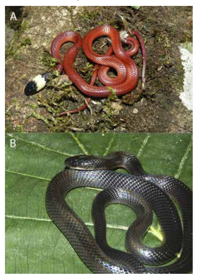
Fig. 2. Individuals of Clelia equatoriana from Quebrada Molletón, Piura, Peru: CORBIDI 14869 (A) and 14875 (B).